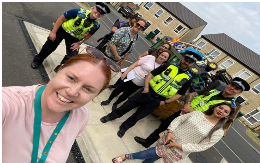
Brighter Heaton: Transforming Communities Together

The collaborative efforts of Bradford West Area Office, local Ward Councillors, Incommunities, and Home Group resulted in a marked improvement in the living conditions and engagement levels of Heaton ward residents.